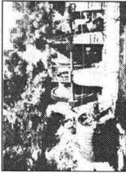
Cable Hoists for East Shaft

The Kennedy Mine Foundation invites individuals, businesses and organizations to become sponsors of the Kennedy Mine.